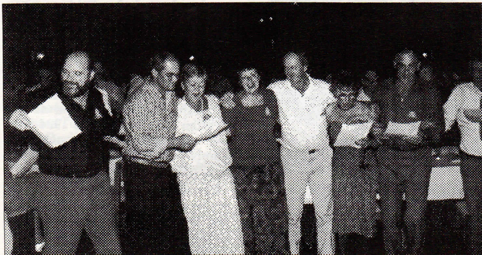
Spirited rendition of the Rort song at Launceston

However it was much different at Launceston this year, the band knew the tune and all Rorters had a copy of the words, and gave a splendid rendition that just about lifted the roof. Let's hope it can be repeated at Grafton next year.